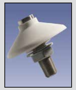
Airbrator Aeration & Vibration