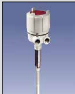
PROCAP IX & IIX Hazloc Capacitance Probe

· Plastics, chemicals, coal/fly ash, concrete, food ingredients, pharmaceuticals, feed/grain, mining, foundries, wood/paper processing, and many other materials