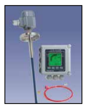
BM-30 LGX Particulate Monitor